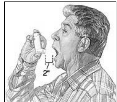
Hold the inhaler 2" away from your mouth.